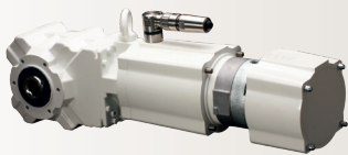
AsepticDrive™ with mounting solutions